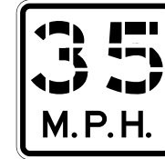
XW13-1-A (To be used below a warning sign only.)